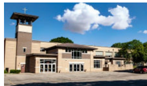
MPH West 1212 S. 117th Street