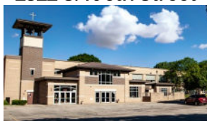
MPH West 1212 W. 117th Street